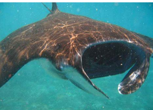
Graceful Manta Rays